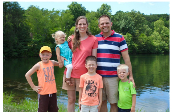
Scioto Hills Family Campers, 2018

"This summer we attended family camp session 1. Our first impression of camp was absolutely wonderful with the welcoming staff who even went so far as to lead us to our cabin. I don't think I can even come close to expressing the thankfulness we felt towards the staff as a whole and especially our amazing counselors who assisted our family during the week . We have told many friends and family how God blessed us through our stay at Scioto Hills. Please extend our thanks to the rest of the staff and please be encouraged to continue the great things you are doing. One of the best parts of camp was actually when we came home. Our 3-year old randomly started singing the Gospel song he learned during class. He sang the whole thing to us and I was in disbelief! I have had him sing it to most people we come in contact with, including non-believers. What an amazing testimony!!! Thank you so much for everything and God bless!"