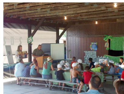
Fitchville Church Plant Kids Bible Club