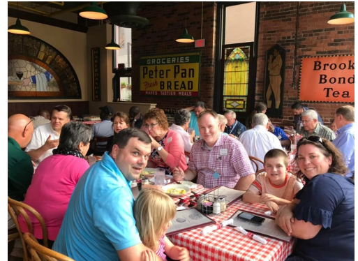
Ohio Gathering in Des Moines

Wednesday, June 26, while at the GARBC conference, the “Ohio Gathering” happened at Spaghetti Works in downtown Des Moines. Many of our OARBC pastors and wives who were attending the conference were able to come for the great food and fellowship. We had some other guests with us from Iowa, Michigan and a special group of international pastors who were there for the conference. We also celebrated my birthday with a cake.