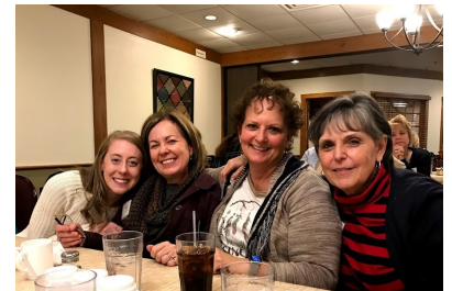
OWM Retreat 2019

See page 4 of this publication for details.