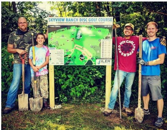
New 9-hole Disc Golf Course