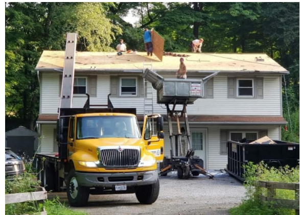
Badly-needed Roof Repair...$8,900

Praise God for all He has done this summer at Skyview Ranch. Our summer attendance was up, along with our Skyview Retreats, and Guest Group rentals! I am eternally grateful for our amazing full-time staff, our apprentices, summer staff, and volunteers who poured into our campers this summer. The Lord spoke to so many students this summer as we had 118 salvations and 613 spiritual decisions!