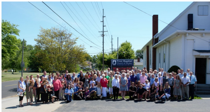
First Baptist, Stryker, 150th Anniversary Celebration

The members of First Baptist in Stryker welcomed friends and neighbors from the community and literally around the world for a special two-day celebration of a very significant milestone – 150 years as an organized church! The church was planted in 1869 by French-speaking immigrants after 12 new believers were baptized over a span of two years. The church remained French-speaking until early in the 20th century. The two-day event included testimonies from former pastors and missionaries, both present and via video and letters, special music, food, fellowship, panel discussions with long-time and newer members, and special activities including an historically-themed scavenger hunt. Most importantly, the gospel was clearly proclaimed by a number of special speakers around the theme, “Together by Grace: Past, Present, and Future (I Corinthians 15:1-2).”