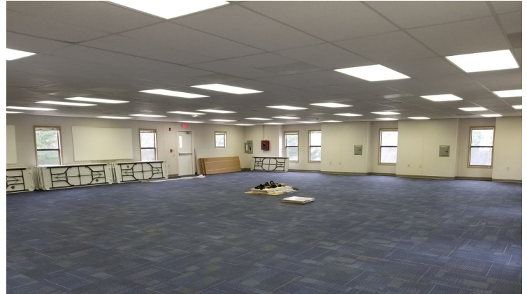
New temporary Dining Hall facility at Skyview