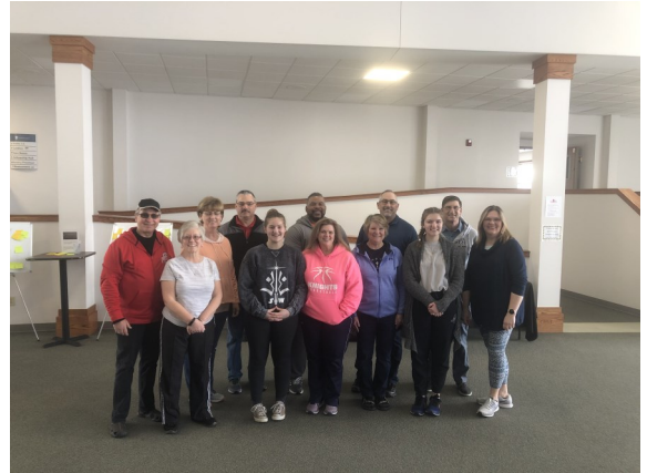
KMT20, Shawnee Hills, Jamestown