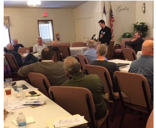
Church Council convened at Dayspring, Galloway

The Dayspring at Alton Road Baptist Church in Galloway has been without a pastor for two years and has reached out to their area OARBC West Moriah fellowship for help. At their request, a council of area pastors convened at Dayspring in January to discuss with the leadership options for the future of their church. Options were discussed, but a clear direction for the church has not yet been determined. At the present time, the church has moved its Sunday morning worship time to 9:00 a.m. so that some of the West Moriah pastors can fill the Dayspring pulpit and then return to their own morning services.