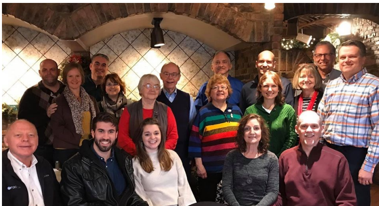
Akron-Canton Pastors/Wives Christmas Fellowship The Waterloo, Akron

The OARBC ten area fellowships are truly the heart of our fellowship. Pastors meet for monthly connection and encouragement.