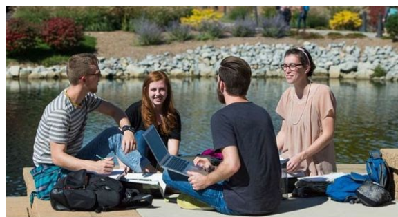
Cedarville students hang out at the pond

Cedarville will match your church's gift to an undergraduate student, up to $500 matched. This scholarship is renewable for up to four years. The recommended date for submission is July 1 for each year.