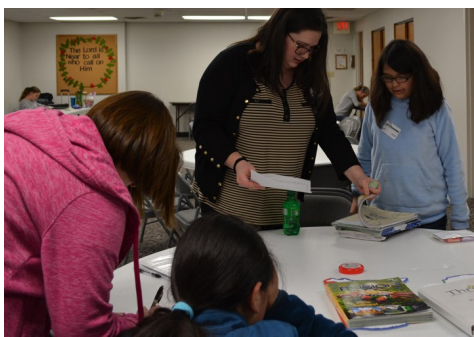
Thrive after school program