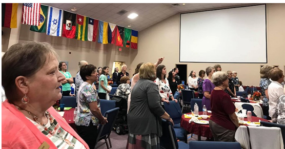
Hearts joined in worship at the Women on Mission Conference at Grand Heights, Fairborn