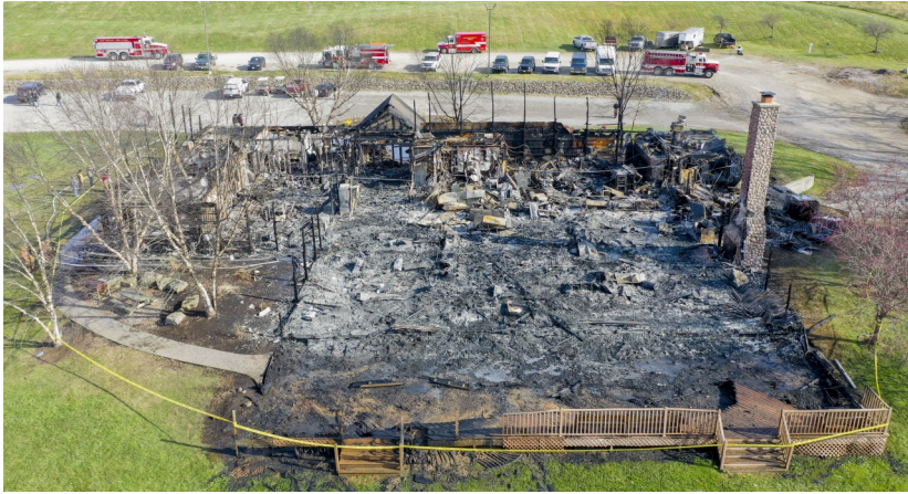
Fire destroyed Dining Hall/Office Complex at Skyview Ranch

In the early morning hours of Sunday, November 10, 2019 the main Dining Hall/Office Complex at Skyview Ranch, Millersburg, was discovered to be engulfed in flames. By the time firefighters were able to extinguish the fire nearly eight hours later, all was lost. Praise God the 100 guests and staff were safely accounted for but the loss is devastating for the ministry. Damage is estimated to be approximately $1.5 million.