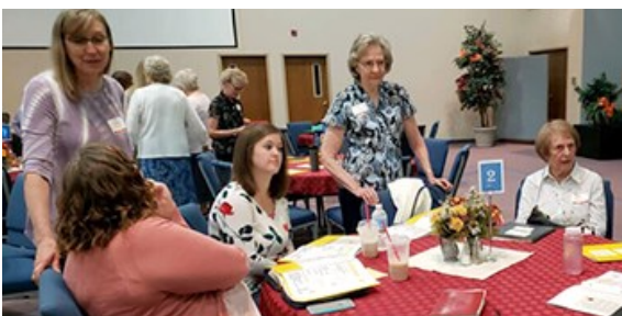
A great time of renewing friendships and making new ones

Ladies of the South Bethel Fellowship gathered at the Grand Heights Baptist Church, Fairborn on Saturday, September 28, 2019, 9 am to 1 pm for the Women on Mission Conference.