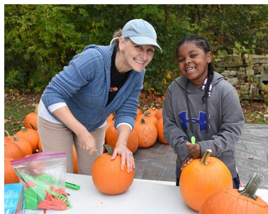
Abram Creek Baptist, Brook Park Annual Fall BBQ Outreach October 19, 2019