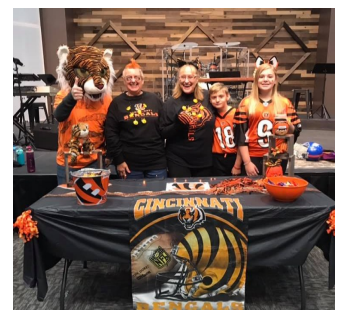
Grace Baptist, Troy holds its first Trunk or Treat... and the adults went all out!