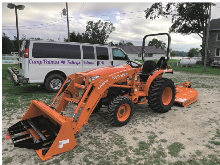
New Kubota Tractor