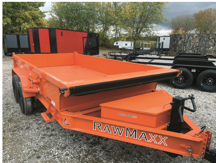
New Dump Trailer

We are thankful for all God did last year and are excitedly looking forward to a great 2024. The many hearts and lives that were changed and challenged through Camp Patmos bring great reassurance to God's faithfulness in this ministry for us, our families, and our donors. Last year gave us the opportunity to speak the truth about God's creation and, on a practical front, rejoice in the donations of a new Kubota tractor and a much-needed new dump trailer. We also want to thank all of you who gave faithfully toward our 2023 deficit to help as we ended the year.