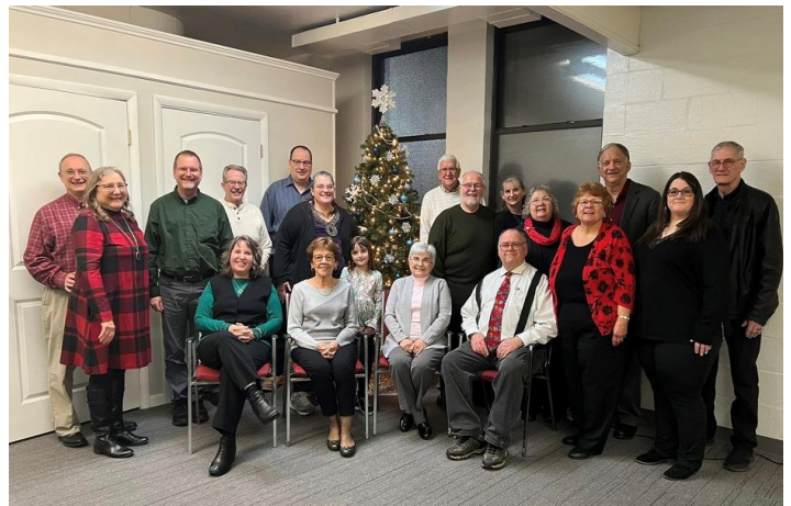
Bethany Area Christmas Fellowship 2024

The ten OARBC area fellowships provide encouragement and friendship for the pastors of Ohio, building lifetime relationships.